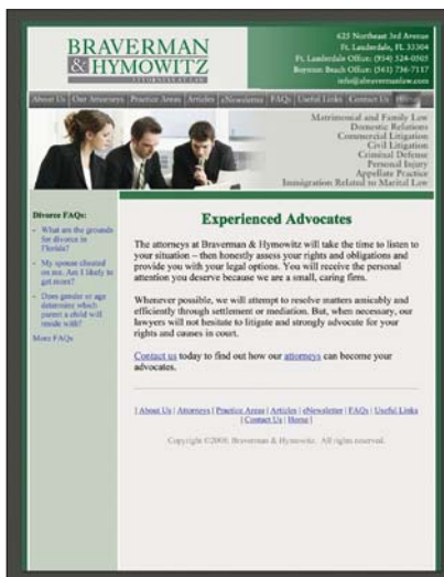
Web Site Design & SEO