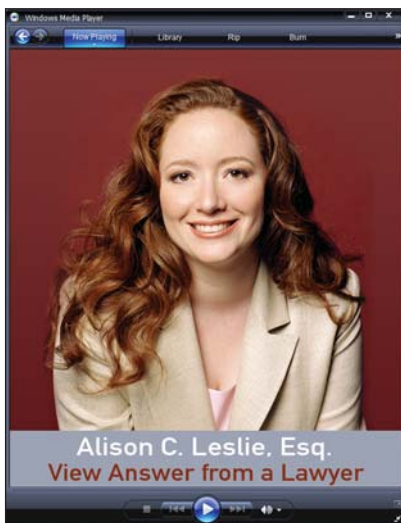
Video Production & Marketing